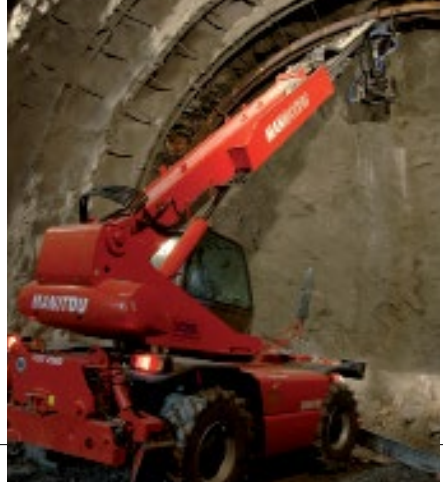
Install your rib with a MRT 2150

44 At last, a solution for the critical rib installation phase?