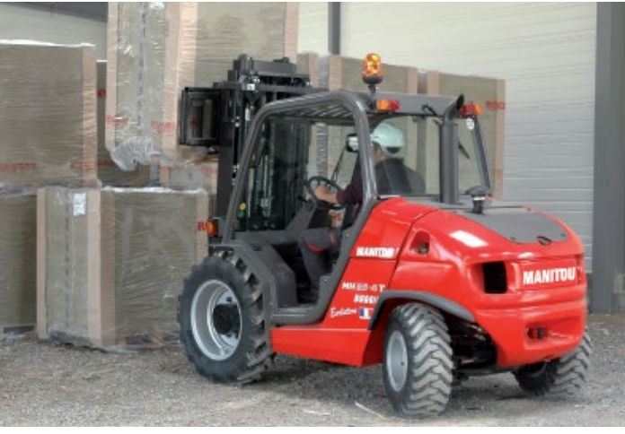
Logistics with a MH 25 - 4 Turbo

Assembly and maintenance of infrastructure with a MRT