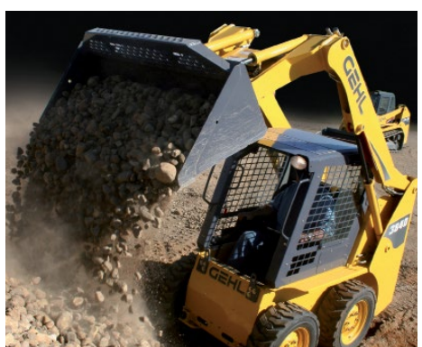
Clearing and flattening surfaces with a Skid Steer GEHL SL3840