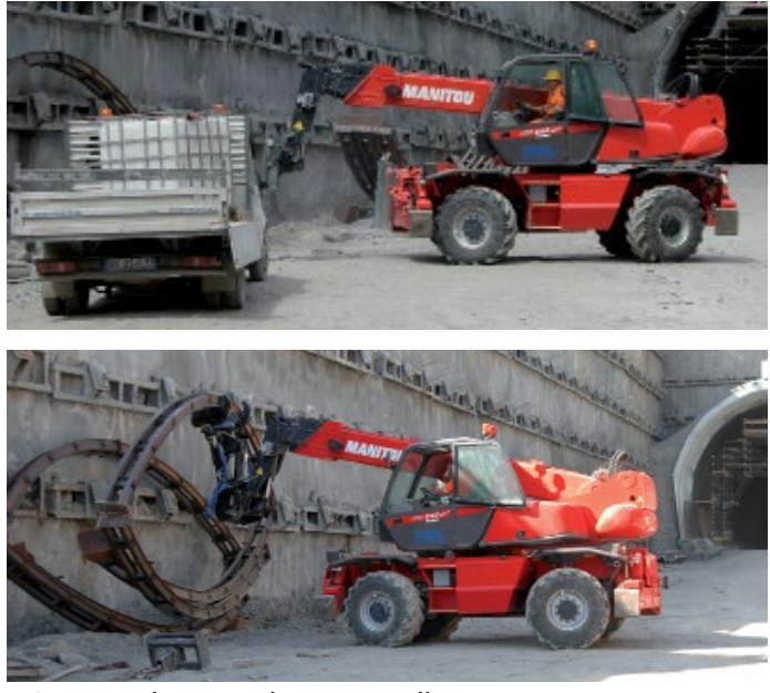
MRT 2150, the versatility per excellence: simultaneously aerial work platform, telescopic truck and crane!