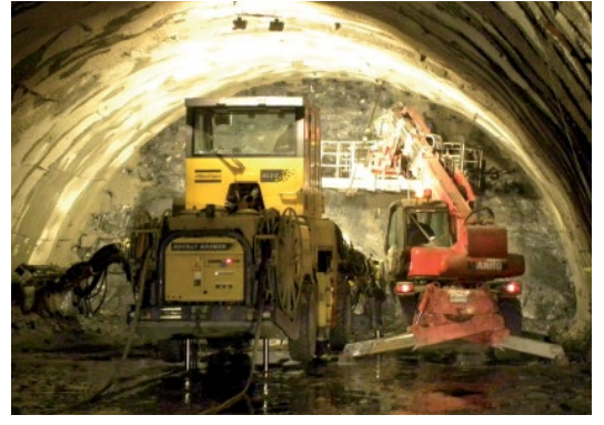
Coordinate simultaneous tasks with a MRT and aerial work platform