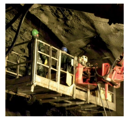
Anchoring the roof bolts with a MRT 1850 work platform

Our certified electrical systems (IP 67) allow the use of our machines in extreme, humid conditions.