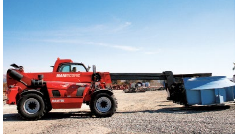
Manage heavy and bulky loads with a MHT 10120